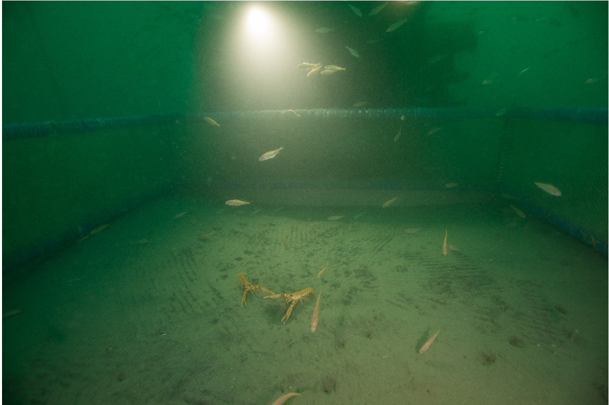
Figure 2. Smart Lobster frame deployed underwater